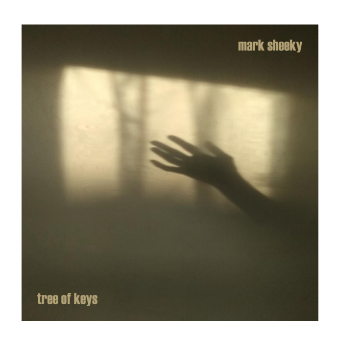
mark sheeky tree of keys